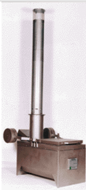
Model A500 227 kg capacity 0.42m 3 chamber