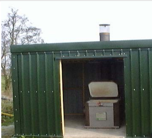
Typical installation in a shed