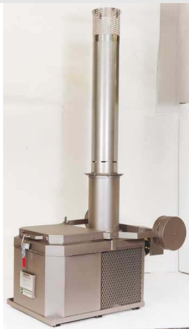
Model A400 181 kg capacity 0.36 m 3 chamber