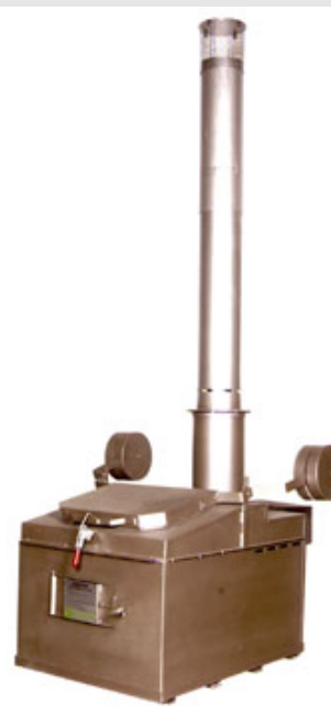
Model A850 386 kg capacity 0.75 m 3 chamber