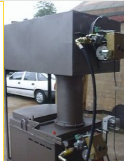
DEFRA approved incinerator with the secondary chamber

Inciner8 Ltd, Unit 9, Shakespeare Hse. 37-39 Shakespeare Street, Southport PR8 5AB, England Tel +44 (0) 1704 548508 Fax +44 (0) 1704542461 Email : info@inciner8.com Web : www.inciner8.com