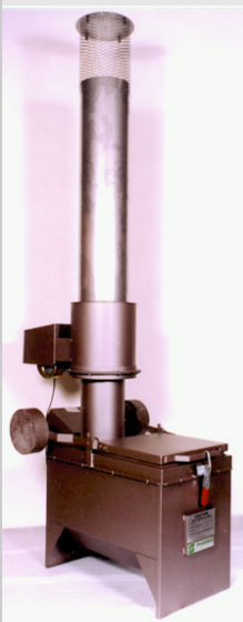
Secondary Burner Option